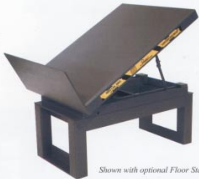
Shown with optional Floor Stand