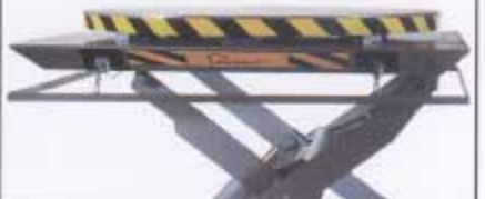
Table top rotates, manually or powered, to enable work to be positioned, minimizing worker reaching, stretching and straining. Spring actuated detent stops are available to locate the platform in 90 degree increments. Various brake systems (manual or powered) are available to stoplock in any position.